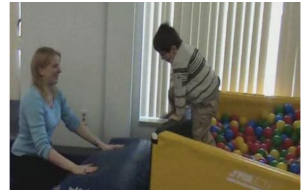
Play with Purpose!